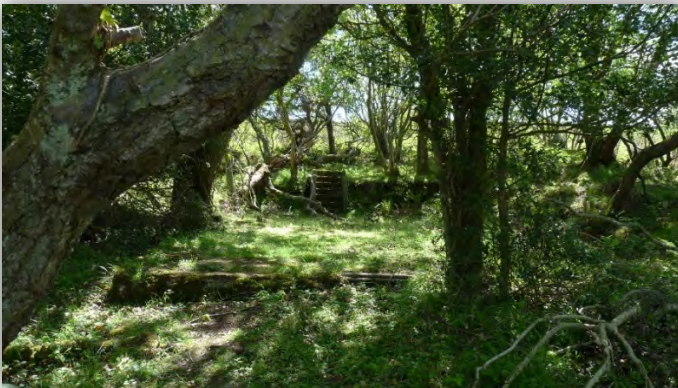
Remains opposite Radar Station

Opposite the radar station there are more building foundations and steps, as well as mangled metal railings in the concrete floor. Do you think something might have been stored underground here? Why do you think there is very little remaining now?